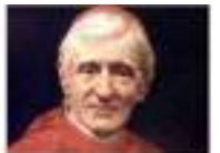
Blessed John Henry Newman