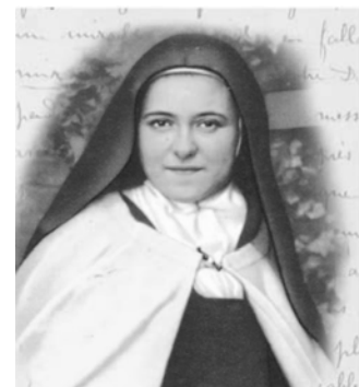
St Therese of Lisieux