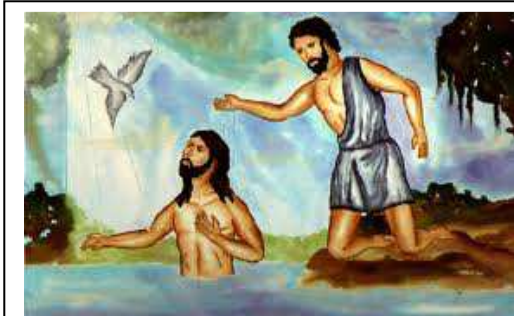
Baptism of Jesus, connected with the Epiphany

Offertory Loose Plate £1974.83 Gift Aid £333.17 Christmas Offering £281.34 Gift Aid £352.00 2 nd Collection for the Newman Fund £1521.68 Many thanks!